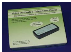
Voice Activated Telephone Dialer