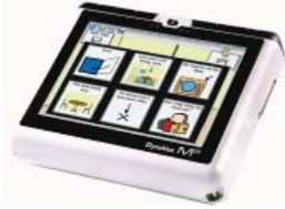
DynaVox Technologies' M3

DynaVox Technologies' M3 DynaVox Systems LLC (pictured)