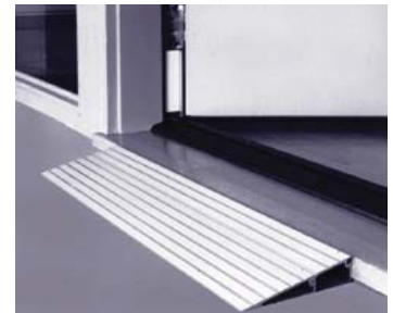
EZ-Access Threshold Ramp

Freedom Scientific (Learning Systems Group)