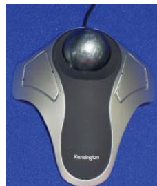
Orbit Optical USB Trackerball

Orbit Optical USB Trackerball Kensington Technology Group (pictured)