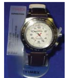
Timex Expedition Vibrating Alarm Watch