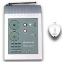
Personal Assistance Phone Dialer

the alert button on the pendant, the base unit dials the first number. When someone answers the phone, your emergency message plays for the listener. Once that person has heard the message, the base unit hangs up and calls the second number, repeating the process. I know what you're thinking: