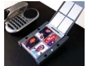
FotoDialer Telephone Companion