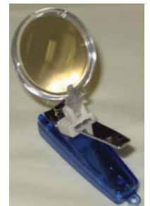
Nail Trapper w/ Magnifier

Nail Trapper w/Magnifier Independent Living Aids (pictured)