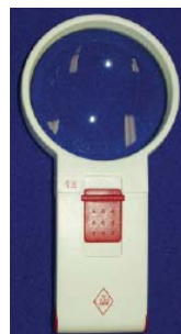
4X Hand Held Magnifier

Freedom Scientific (Blind/Low Vision Group)