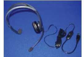
Noise Canceling Headphones

Zoomcaps White on Black & Black on White