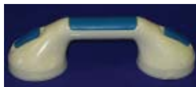
Get-A-Grip safety bar

Our first bargain is brand new to the inventory of the ATRCs—suction cup bath bars. We have several brands in our inventory— Get-A-Grip , Safe-er-Grip Bathtub Safety Rail , and Quick Suction Grab Bar . Unlike standard bath grab bars, these use strong suction to attach to the wall, bathtub, or whatever surface you put them on. This ease of installation makes them seemingly ideal for use when installation of standard grab bars seems difficult or impossible. However, the manufacturers do say that these are not