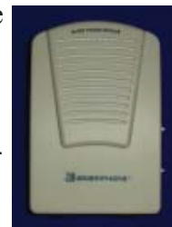
Ameriphone Super Phone Ringer

besides the telephone line. For the cost, this is one great bargain. Now, it may not help someone with a hearing impairment outside the house when the phone rings, but it is very likely to help her hear the phone ring inside of the house. The unit can be purchased from Hear More either online, www.hearmore.com , or through a telephone order at 1-800-881-4327.