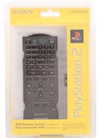
PlayStation 2 controller

My next bargain is actually a tip I received from an AAC discussion group, and it's pretty neat! If you are an individual who uses an AAC device with an infrared (IR) output so that you can control a