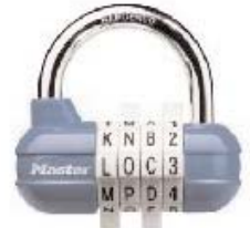
Wordlock by Master Lock

This is a great little lock for those with memory problems or anyone who has problems remembering seemingly random information. Lowe's has the Master Lock version available for about $7.50. The original