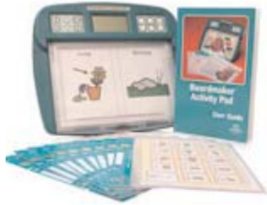
Boardmaker Activity Pad