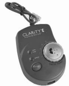
Portable Phone Amplifier