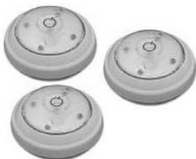
LED Puck Lights from Home Depot

Next up are stick-on LED lights. These handy little lights, sometimes called puck lights since they resemble hockey pucks, are low-cost, lightweight, and can be placed almost anywhere. Many have adhesive backing so all you have to do is peel the backing and stick it up wherever you want it. The nice thing about these lights is that they don't