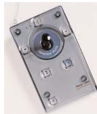
Roller Plus Joystick