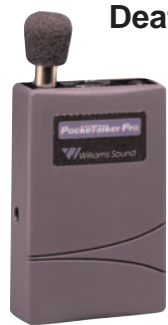
PockeTalker Pro by Williams Sound

Hearing Helper System 350E – Williams Sound