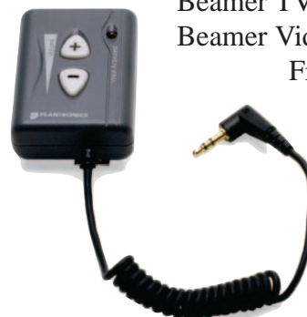
Cellular Phone Amplifier by Plantronics