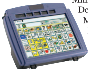
Vantage Plus WordPower by Prentke Romich

8 Message Communicator Multiplex – Enabling Devices