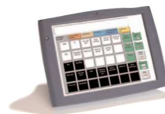
DV4 by DynaVox