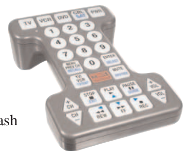
Oversized Universal Remote Control by TK Partner

Oversized Universal Remote Control – TK Partner