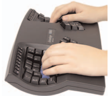
Kinesis Advantage USB keyboard features a contoured shape.

But use of a keyboard and mouse can cause even more discomfort in people with arthritis. Consider using an ergonomically designed keyboard and mouse—devices that are designed to accommodate your hands, instead of your hands accommodating the devices. There are many different options available.