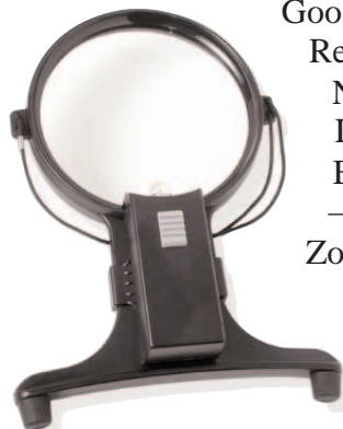
Hands Free Magnifier by Carson Optical

Retractable Pocket Magnifier – Ultra-Optix