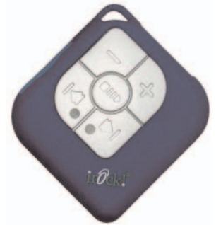
IROCK-930 MP3 player

www.amazon.com . Now don't be confused if you do a search on the IROCK-930 and it shows you the EZMP3 player 128 Mb.