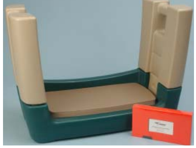
This garden kneeler/bench is available at your local ATRC.

Knee Pads that attach to long pants can be made from two 5" by 5" pads of 1½" thick foam. Sew a heavy duty, durable fabric around the foam like a pillowcase, attach