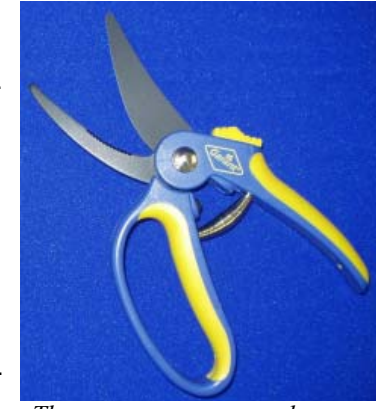
These pruners reopen when you release your grip, and they are available at your local ATRC.

When all is said and done, the idea is to get out in a garden, be creative, and the rewards will follow!