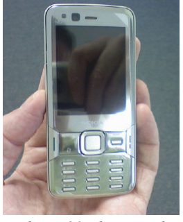
Nokia N82 phone with knfb Reader installed

the same functionality of the original reader was packed into a Nokia N82 mobile phone for about half the original price. It's portable, fits into many pockets, and can also be used as a mobile phone with a camera. If you would like to see a demo of the knfb Reader , please call your local ATRC to set up an appointment.