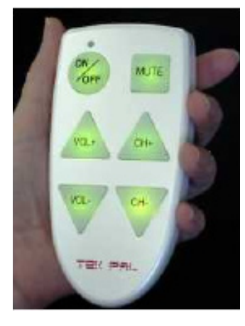
Tek-Pal TV remote

Our final bargain proves that simplicity is the best way to go. The Tek-Pal TV remote is simplicity at its best. At a time when TV remotes can have as many as 20 buttons on them, the Tek-Pal offers a remote with just 6 buttons—on/off, mute, volume-up, volume-down, channel-up, and channel-down.