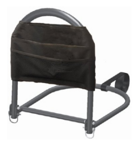
Bed Rail Advantage

Our next bargain is the Bed Rail Advantage , and it's a great low-cost way to assist you in getting up and out of bed. It's made of heavy-duty steel so it can take some use. It even has a two-pocket covering that can hold magazines and/or a TV remote, and it