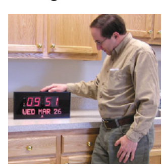
Big Digital LED Calendar Clock

I wanted to take a moment to thank you, the readers, for the wonderful response I have been getting about the Bargain Basement. I wondered for the longest time if anyone was really reading this, but you have more than shown me that not only are you reading, but you are also buying the bargains. So I thank you all for your support, and please keep sending the feedback. And now...the bargains!