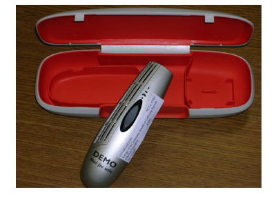
Amigo T10 Transmitter