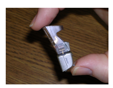
Amigo T10 Receiver

DATI recently received two loaner FM systems from HLADE (Hearing Loss Association of Delaware). HLADE is a support group for persons with hearing loss with ties to the national organization, Hearing Loss Association of America. These systems are available for trial use before purchase by an individual, family, workplace or school system.