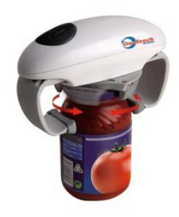
One Touch Jar Opener

Opener. You may have seen the commercials for this nifty little gadget. This product is unlike other automatic jar openers that may be constrained to a particular jar size for operation. Because this unit does not have a chamber into which the jar is placed, it is not limited