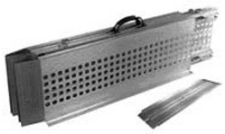
Suitcase ramp (shown folded)

rary need, if you need some assistance with Assistive Technology, give us a call. We're here to help. ■