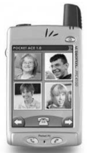
Pocket Ace by AbleLink Technologies is an accessible cell phone.

A talking timer can be programmed with your own voice recording.