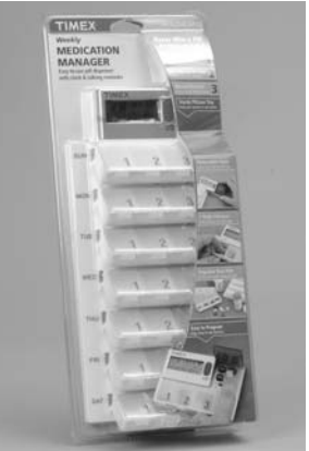
Weekly Medication Manager by Timex

Memory Aids A medication reminder with an automatic timer may help individuals take their medication on time.