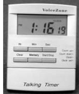
Talking Timer by Voice Zone

clock helps individuals keep track of the date and time.